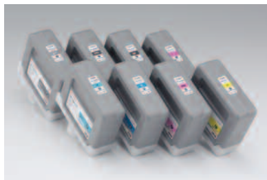
8-color inks for ultra-high-quality imaging