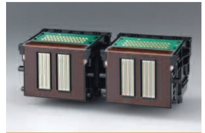
Two print-heads ensure fast output